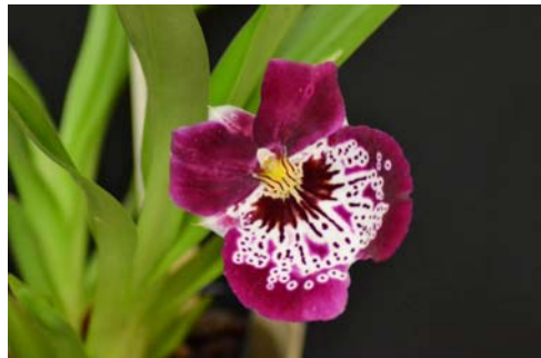
Labeled Brassidium Shooting Star, flowers indicates it is Miltonia, grown by A. & C. Bridgwaters