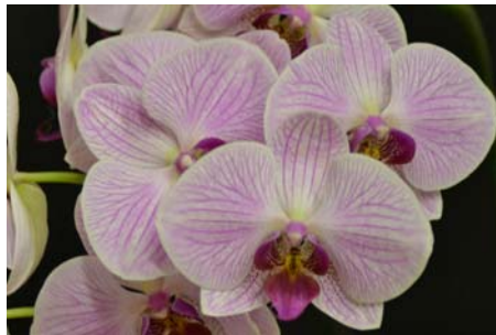
Oncidium Sweet Sugar and Phals below and above all grown by Gwen Howard