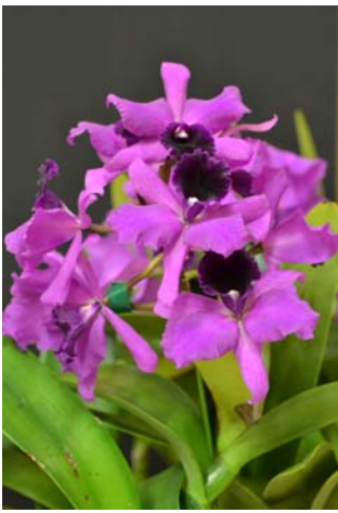
Cattleya Lucky Strike grown by Gian Frontini