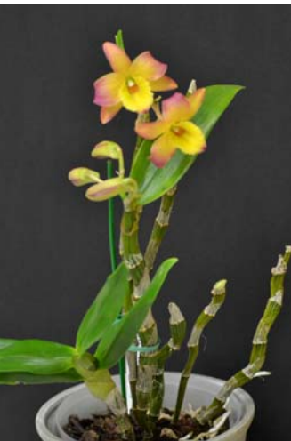
Dendrobium Oriental Smile 'Fantasy' grown by A. & C. Bridgwaters