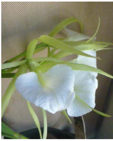
Brassavola Little Stars grown by Dorothy Young