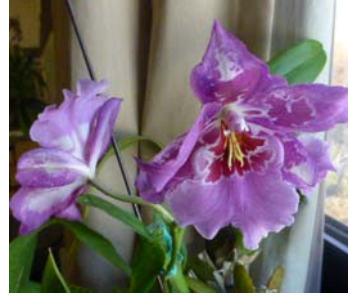
Vuykstekeara Patico 'Pacific Nights'