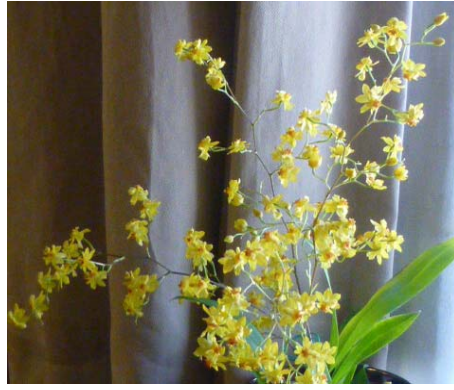
Oncidium Twinkle 'Yellow', Linda Stroud