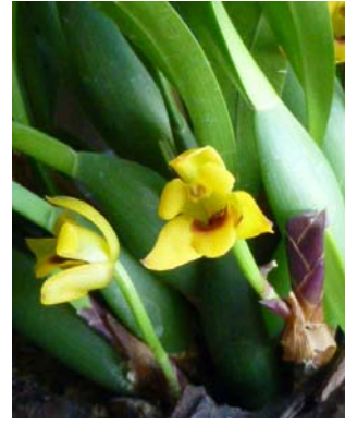
Maxillaria variabilis