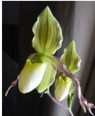
Paph. glaucophyllum x roebelenii, Gwen Howard