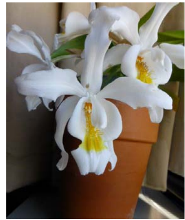
Coeloglyne cristata 'Short Hills' grown by Nalini Stiernerling