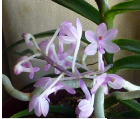
Ascocentrum christensonianum grown by Alan Bridgwater