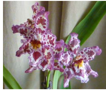
Burrageara Pacific Ripple 'Coqui Poke'