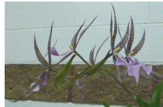
Miltassia C M Fitch 'Izumi' grown by Ken Pearce